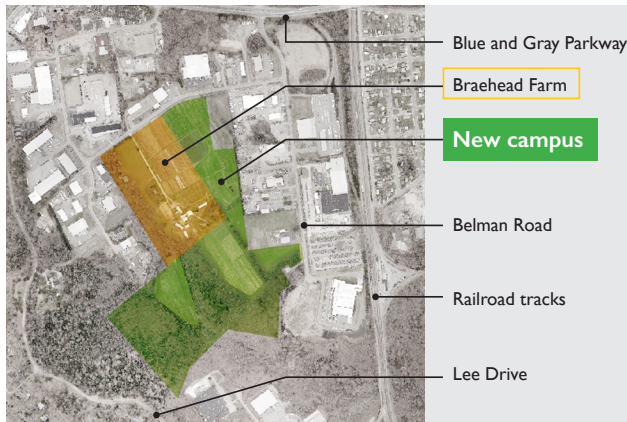
Location of the campus extention